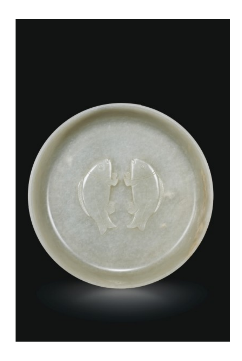
"May you be as harmonious as a fish and water."

A well carved white jade 'Twin Fish' brush washer Qianlong Period (1736-1795)