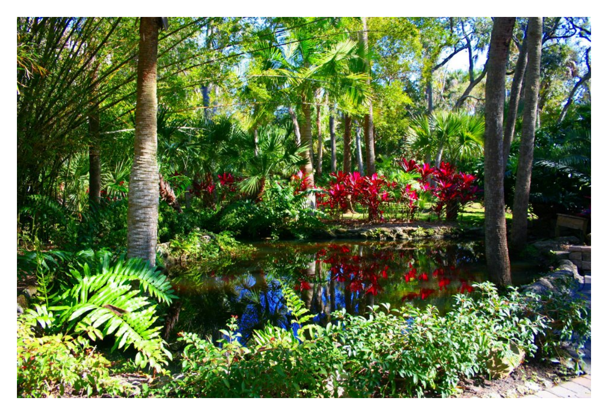
Florida Tech Botanical Gardens

Location: https://fit.zoom.us/j/95275285484